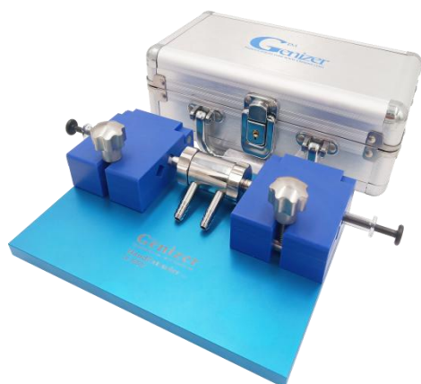
HnadExtruder-RT (Packed with Genizer Box)