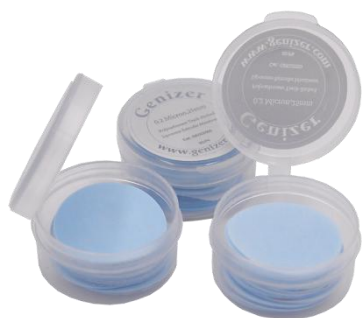
Track-Etched Liposome Membranes (19mm)