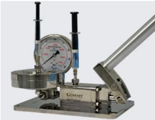
HandPump with Liposome Extruder