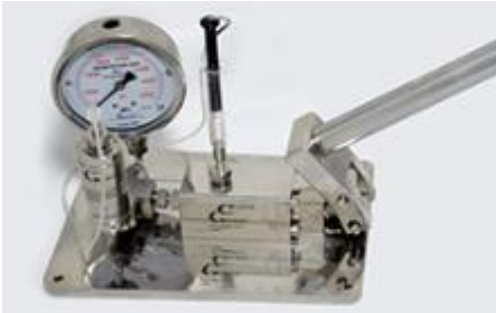
HandPump with Chamber