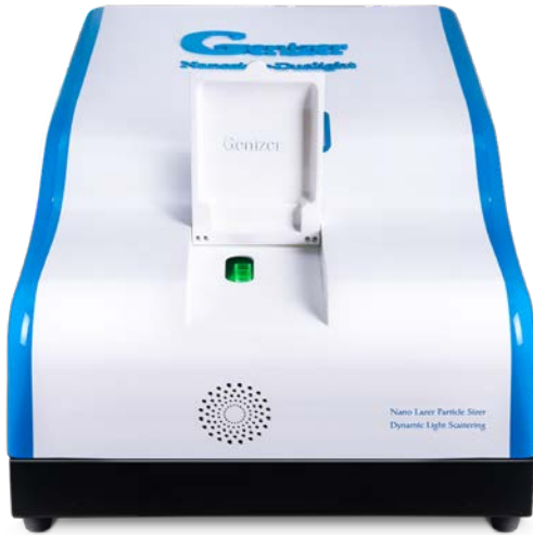
Dual-light Particle Sizer