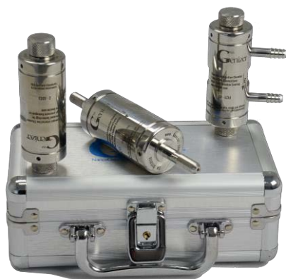
Diamond Interaction Chamber